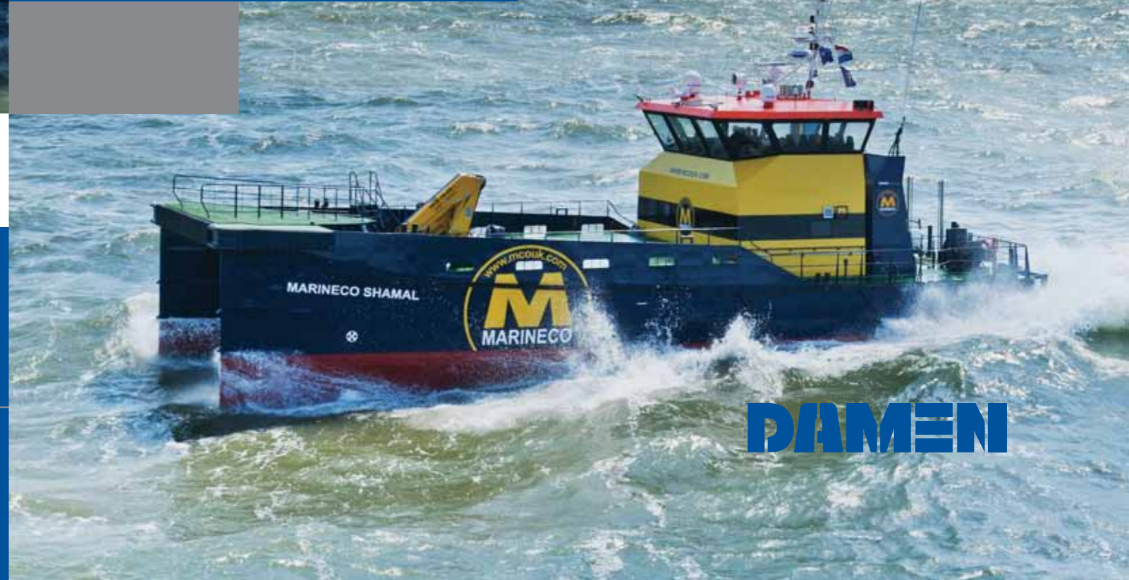
DAMEN FCS 2610