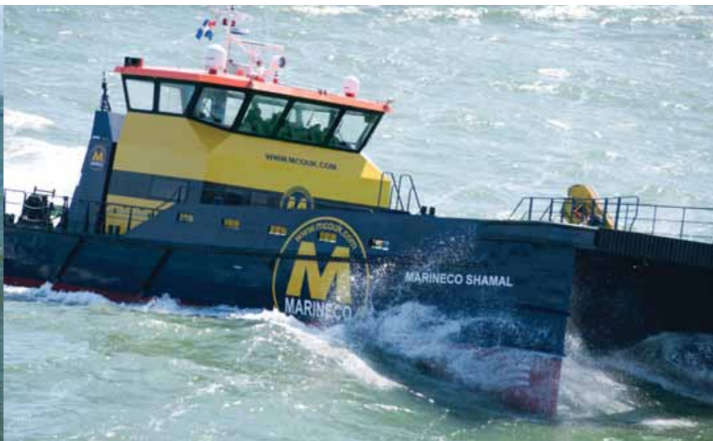
DAMEN FCS 2610